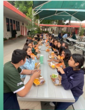
6th graders enjoying PIZZA on Fridays!

Congrats to last week's Pat on the Back recipients! Saints doing good!